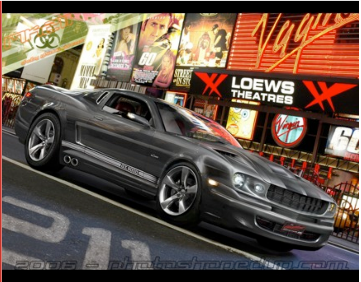
MK211 - "The Next Eleanor"